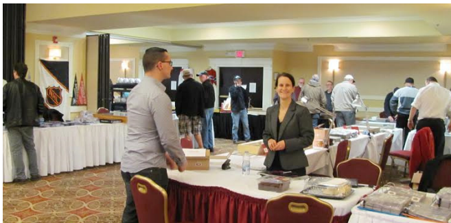
Collector Show action with the show's hostess. Visit the Members' section of our website for more photos.

The next coin show in our area is in March in Florenceville, NB, I believe. So until then, happy collecting!