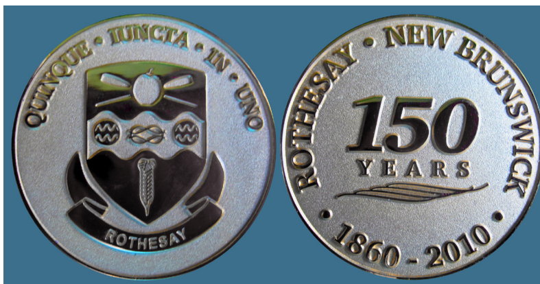
2010 Rothesay Medal