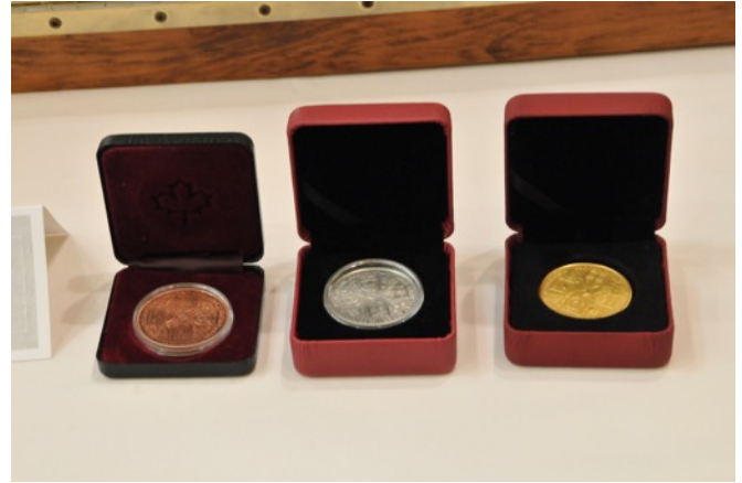
Bronze, silver, and gold display medals