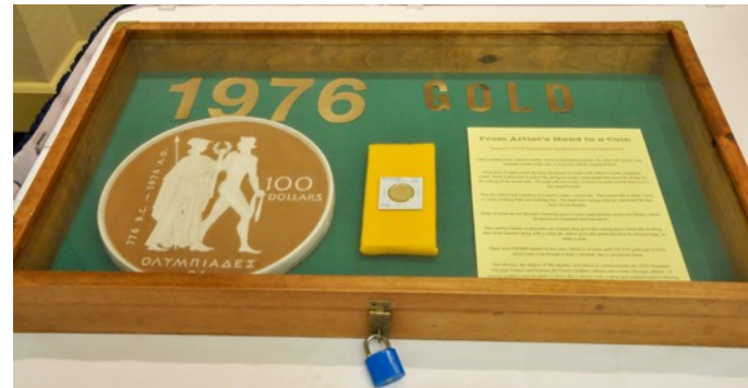
Editor's exhibit - 1976 Gold Coin