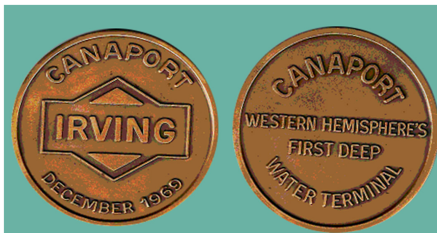
1969 Irving Canaport medal