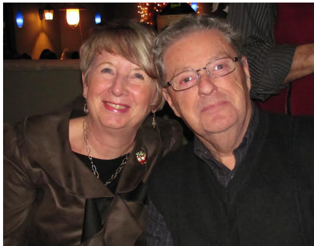
The lucky 1st & 2nd place winners